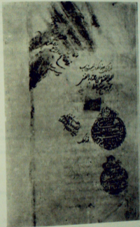
Picture from Kitāb'u'l-Qānūn (ca. 2272) showing the 2 Royal seals of the Qutb Shāhi Kings of Golconda: 1) Muḥammad Qutb Shāh 2) Muḥammad Qutb Shāh dated 1020 A.H.