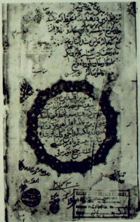
A page from Tahṣiru Uqlīdas, showing illuminated Shamsah with inscriptions. This Royal Codex bears the seal of Ibrāhīm 'Adil Shāh II (Naṫras) King of Bijāpūr (cat. No. 2181)