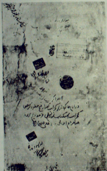
Photo from Sharbu Kulliyati'l-Qānūn (cat. 2276) showing seal and autograph of ḥān-e-Qānūn 'Abdu'r-Rahim Khan son of Isairam.